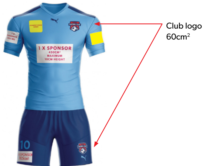
Diagram 5 - Club Logos