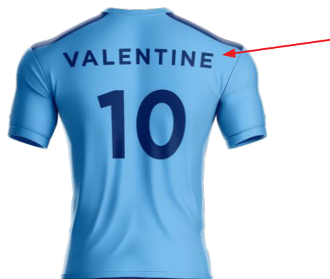
Diagram 2 - Players Name on Shirt