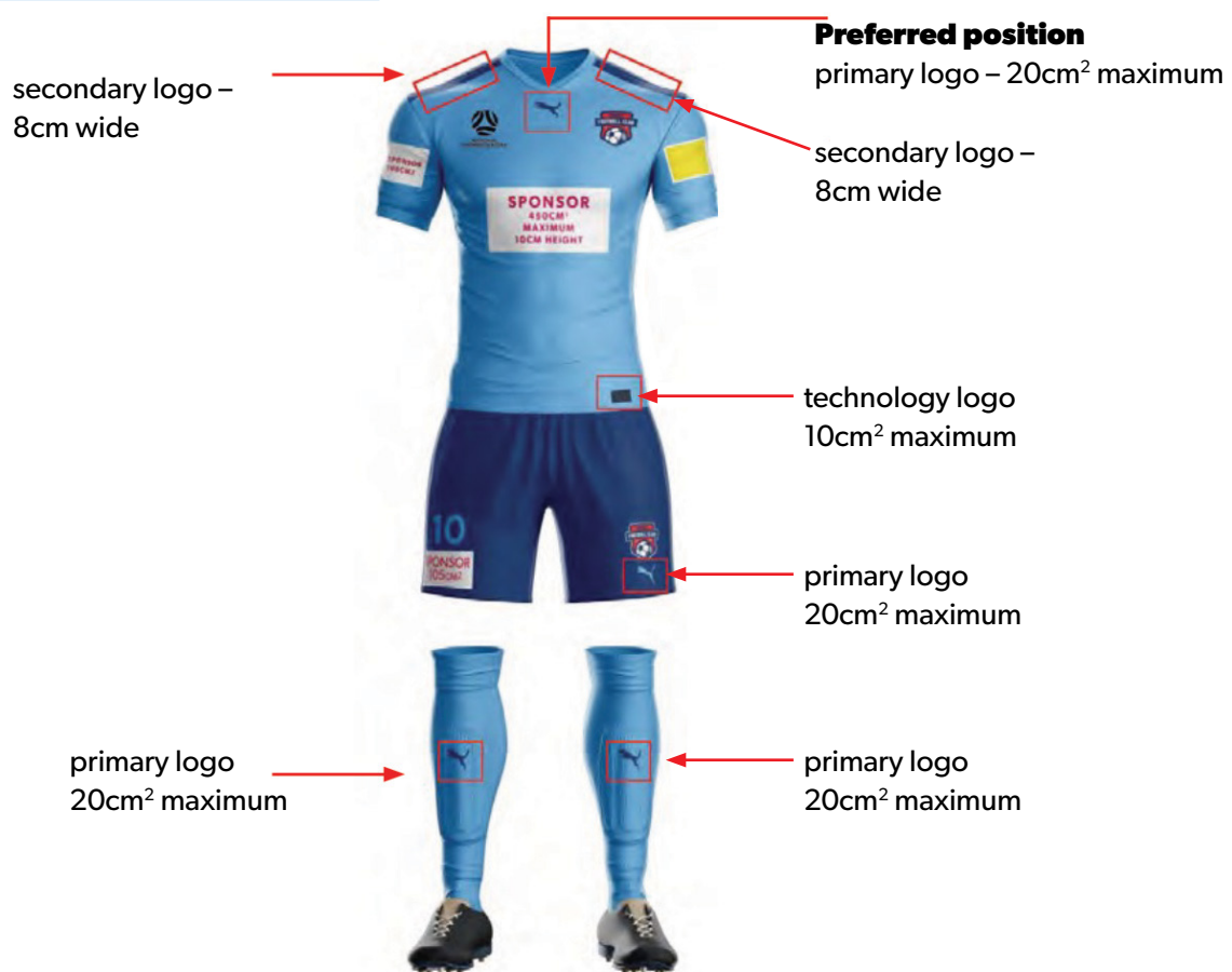
Diagram 4 - Manufacturers Marks