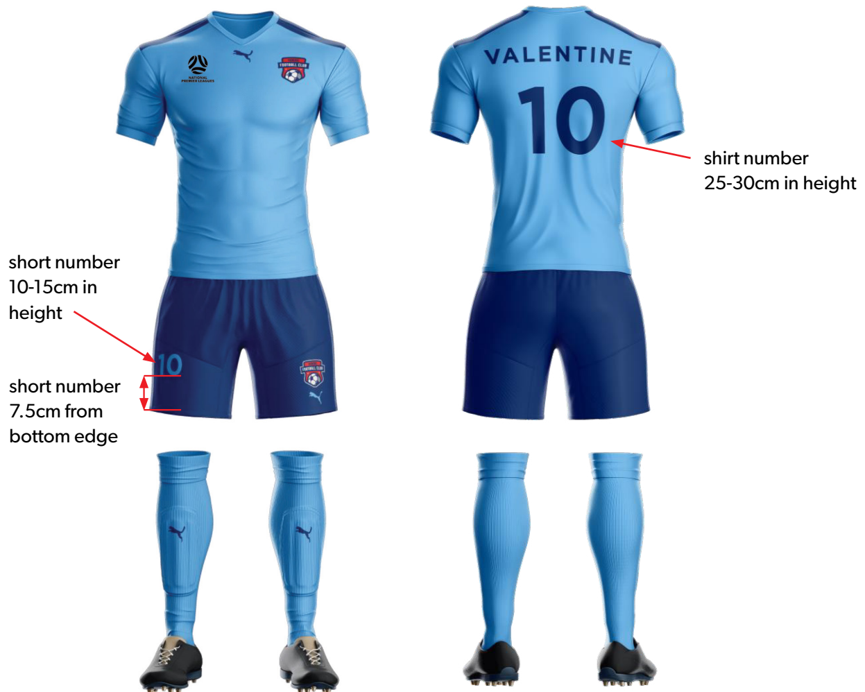
Diagram 1 – Shirt and Short Numbers