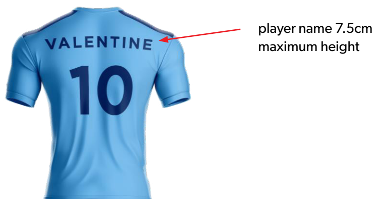
Diagram 2 - Players Name on Shirt