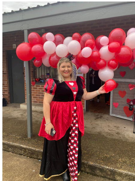
* Queen of Hearts (Eastern Creek Pioneers SC)